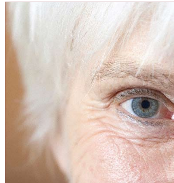
If you are female 50 years of age or greater, your chance of developing dry eye is even greater.

Also, keep in mind that many medications required by adults over age 40 may cause or worsen dry eye problems. Examples include diuretics (often prescribed for heart conditions) and antidepressants. If you suspect a medication may be the underlying cause of your dry eye, be sure to discuss