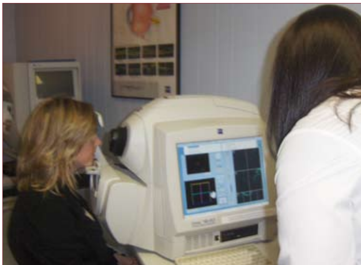
Above | OCT (Optical Coherence Tomography) instrument.

Family Vision Center in Stratford has recently upgraded our OCT (Optical Coherence Tomography) instruments from the Stratus to the Cirrus. The Cirrus is the newest OCT in the market. Creator Carl Zeiss Meditec latest technology offers high definition imaging advancements of the inside of the eye.